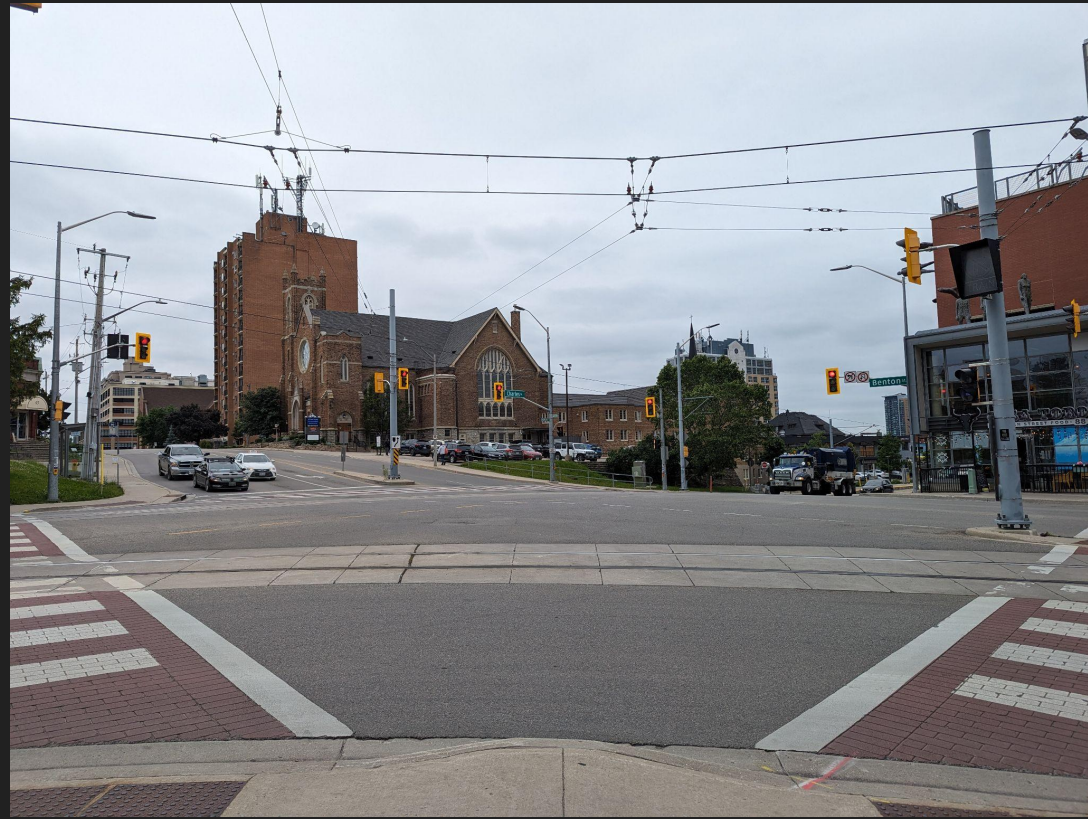
Intersection at Benton St and Charles St

Even those who are able to walk down the hill to Charles St may choose not to because the intersection is wide, loud, busy and overwhelming.