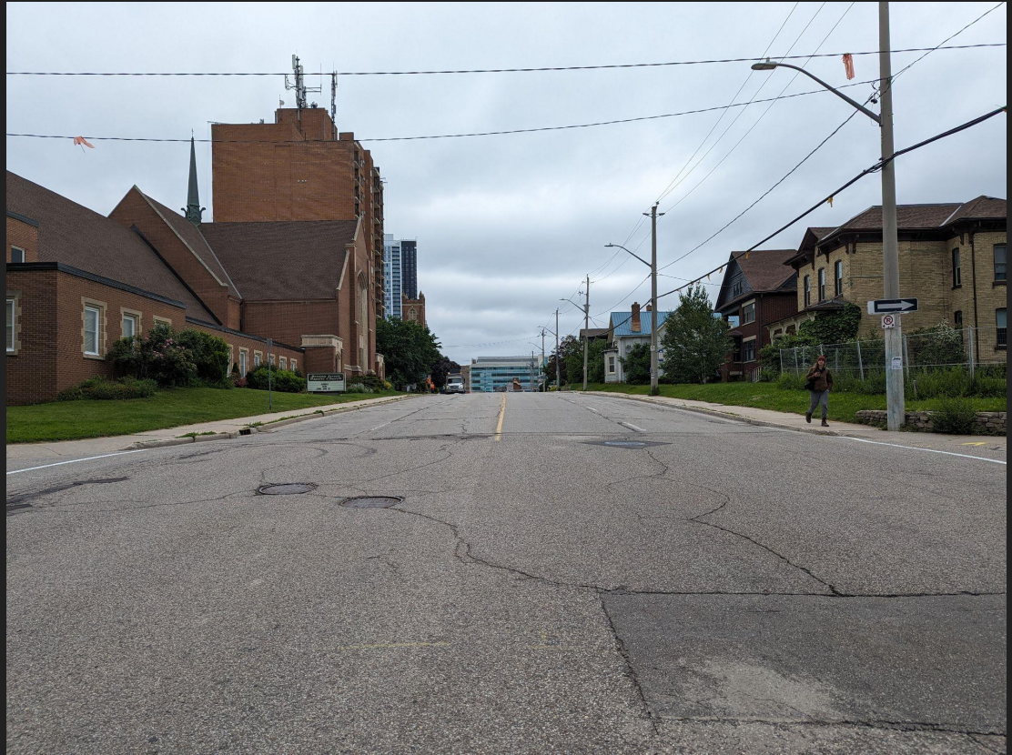
Benton St between Courtland Ave and Charles St

We're excited for both Phase I and Phase II of the project. The infrastructure will make cycling and walking safer.