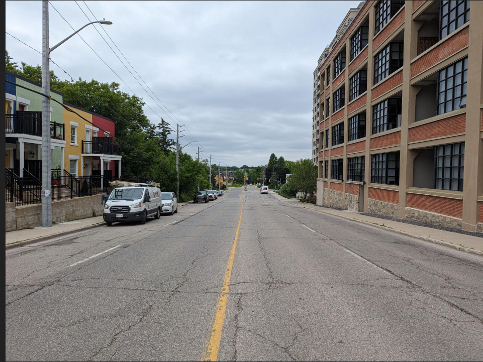
Benton St between Courtland Ave and Charles St