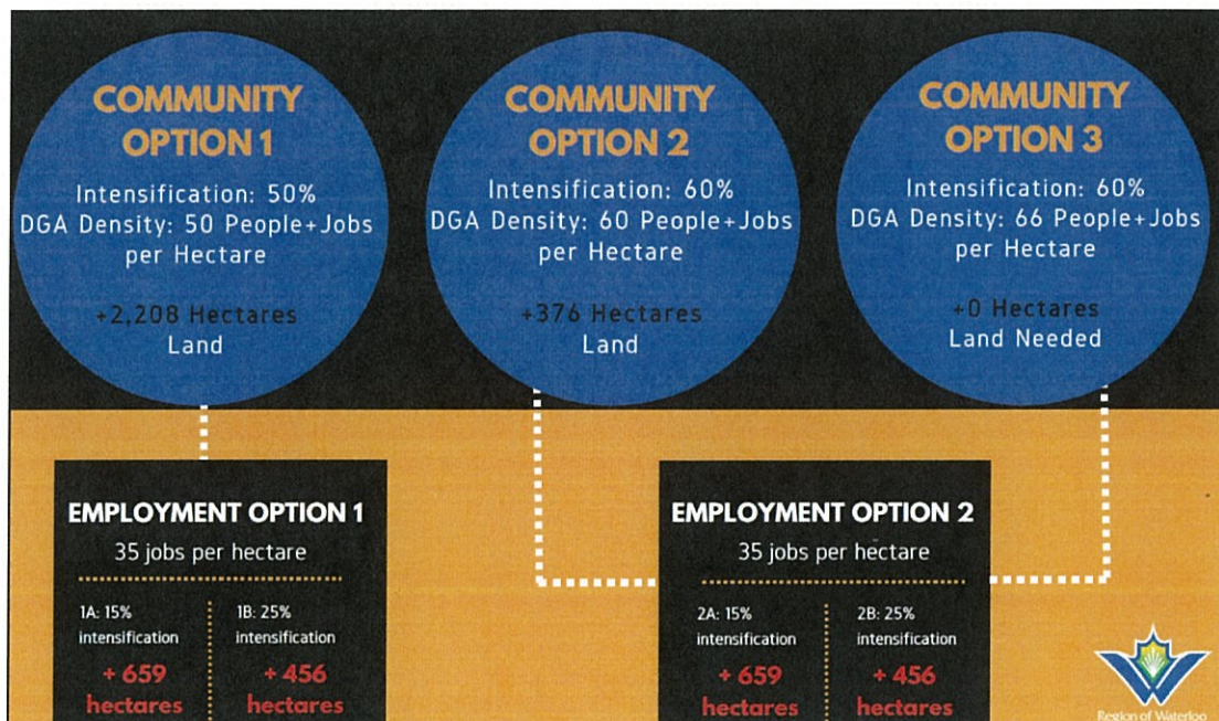
Figure 2: Illustrative Growth Options

Staff developed the three options in response to, and consistent with, Council’s motion on November 9, 2021 regarding the preliminary results of the draft LNA released at that time. In particular, Council directed staff to prepare the LNA in accordance the Provincial methodology, review the draft LNA with the community, and then report back to Council on the results of the consultation process prior to finalizing the LNA.