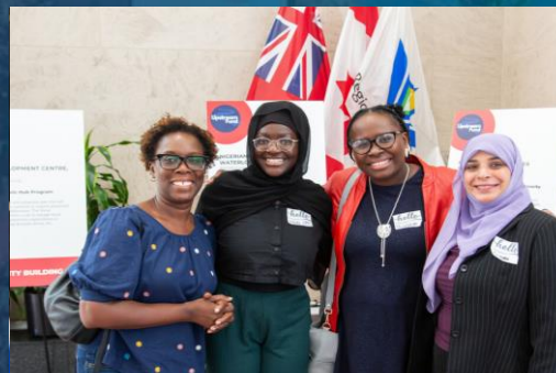
Delivering accessible and equitable services