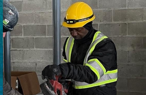
Growing local economy & employment opportunities