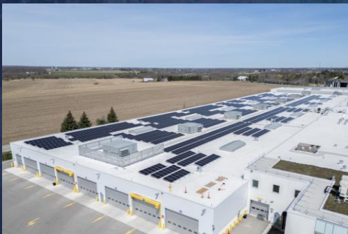
Adapting to and mitigating climate change