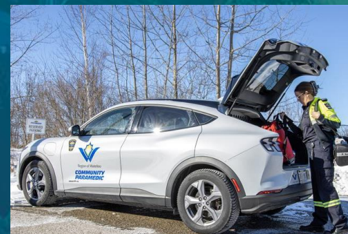
Improving access to public health and child care