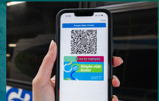
Modernizing service delivery and leveraging cutting-edge technology