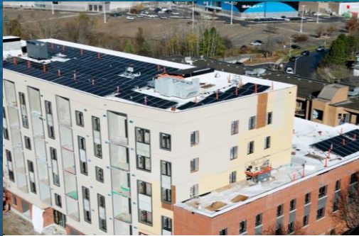
Creating and preserving affordable housing