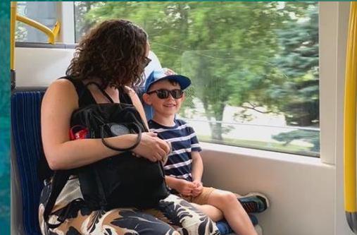
Improving transit and helping people get around